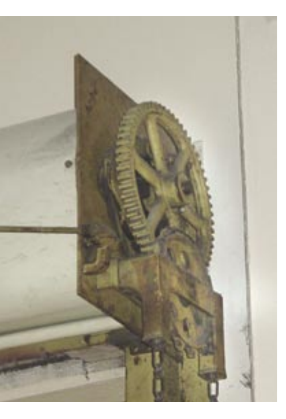
Before retrofitting, most fire doors have complex systems of mechanical gearing, governing devices and release mechanisms.

Bases loaded, two outs, bottom of the ninth . . . That's a critical scenario that requires the right pitch. And believe it or not, baseball is not the only situation to which that can apply!